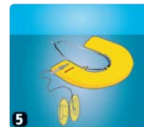
LifeSaver inflates itself!