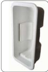
Stowing box P/N LS50-0202