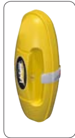
LifeSaver P/N LS50-0100