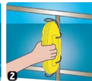
Remove LifeSaver from its holder ...