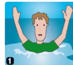
When an accident happens ...

LifeSaver is easy and safe to use. Since it is always close at hand and requires no preparation, a person in distress can get help within seconds.