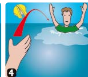
Throw LifeSaver close to the person in distress. It is easy to throw accurately.