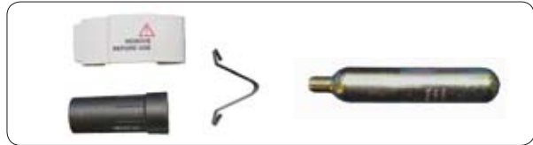
Re-arming kit P/N LS50-0203