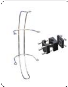
Stainless steel holder with bracket for 25 mm tube P/N LS50-0201