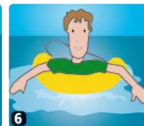
Pull LifeSaver over your head and tighten the recovery strap.